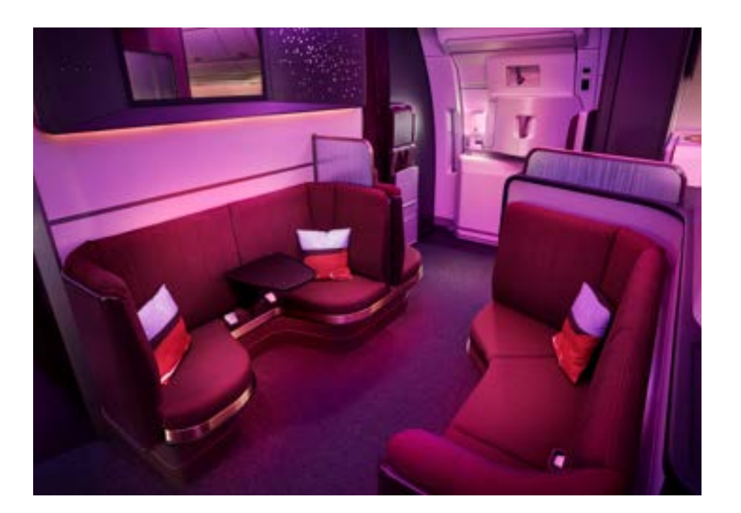
<sup>†</sup>21+ please enjoy responsibly <sup>‡</sup>Product and configurations may vary depending on aircraft type and size